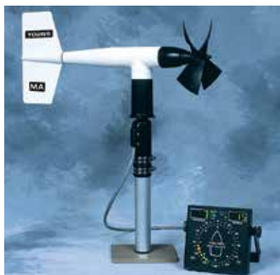
Wind Monitor – MA pictured with Marine Wind Tracker display.