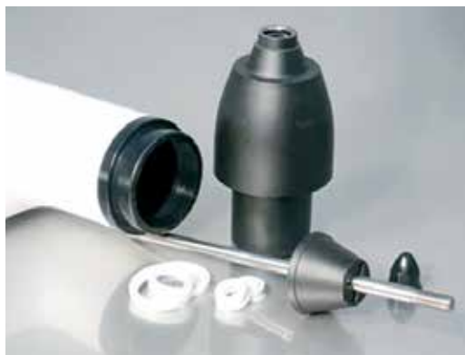
Ceramic bearings are long lasting and corrosion resistant.